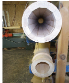
Staves 1-1/2" (3.8cm)

Optional Load Bearing Solid Core Solid wood load bearing wood core available. Check with your structural engineer for requirements