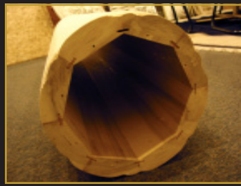
Laminated Hollow Construction 1-1/2" walls for 5" & larger