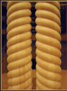
Left or Right Twists